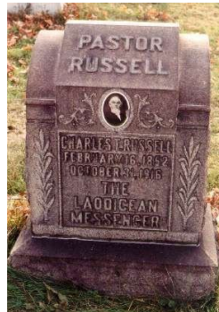
Pastor Charles Taze Russell Born 1852 Died 1916 Jehovah's Witnesses Founder